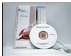
*Computer Interface Kit - connects to any Windows™ application