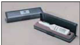
Hard Plastic Protective Case - protect your investment